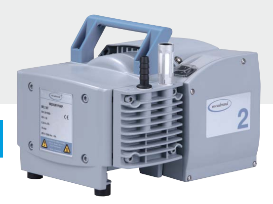
ME 2 NT 2.0 m<sup>3</sup>/h 70 mbar